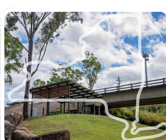
Highway Rest Stops